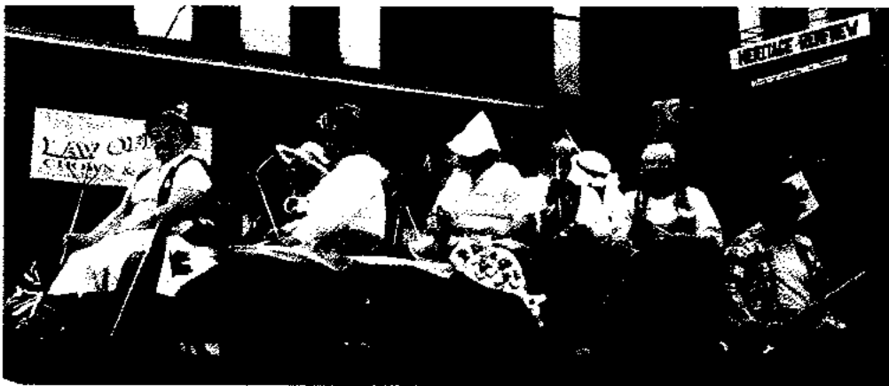
Renfrew & Area Heroes from the Great War -

Do you have a viewpoint you wish to share? Write to us today to share your views. Information on future discussions related to this issue can be obtained by writing to the editor.