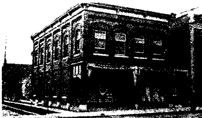
The Handford Block, then and now.

Listed above is what is believed to be a complete list of heritage-designated properties in and around Renfrew.