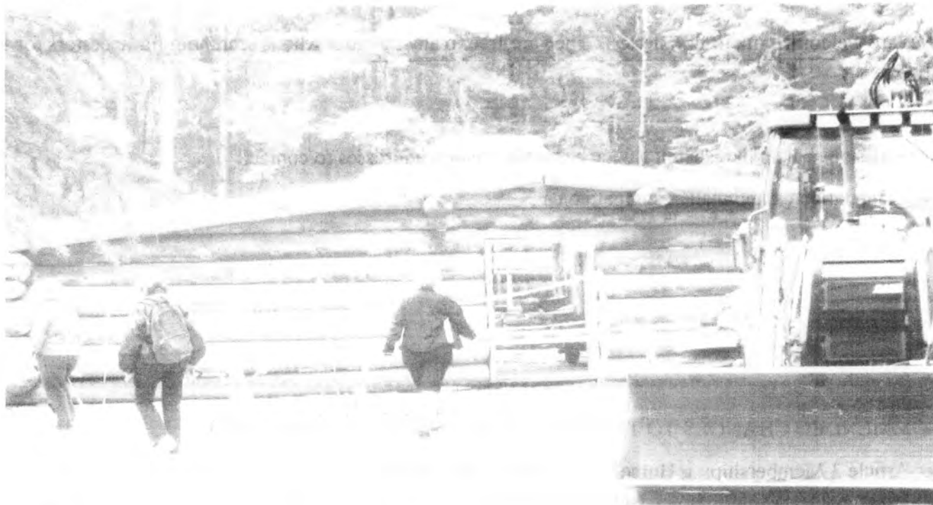
Camboose used by lumbermen is being reconstructed at Algonquin Park lumber diisplay