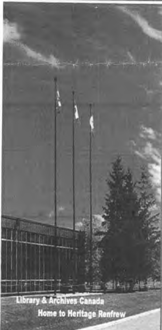
Library & Archives Canada Home to Heritage Renfrew